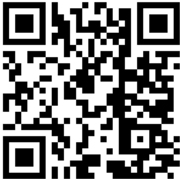
Privy / Woodshed